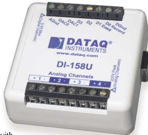
Shown: A DI-158 with the USB interface option

Options include a USB or Ethernet interface and high level gain/high full scale range. USB devices are powered through the interface while Ethernet devices require a provided AC adapter. Gain range per channel options are 1, 2, 4, and 8 with a full scale range of \pm 10 volts or 1, 2, 4, 8, 16, 32, 64, 128, 256, and 512 with a full scale range of \pm 64 volts.